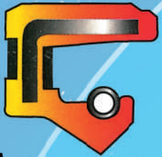
A Rubber covered O.D., metal insert, sealing lip with garter spring