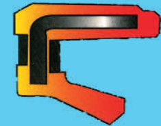
VC Rubber covered O.D., metal insert, sealing lip