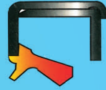
KA Outer metal case with reinforcing cap, sealing lip with additional dust lip