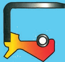
BS Outer metal case, sealing lip with garter spring and additional dust lip