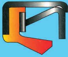
VA Outer metal case with reinforcing cap, sealing lip