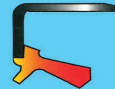
KB Outer metal case, sealing lip with additional dust lip