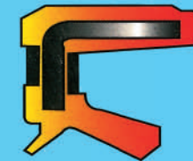
KC Rubber covered O.D., metal insert, sealing lip with additional dust lip