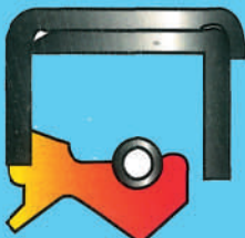
CS Outer metal case with reinforcing cap, sealing lip with garter spring and additional dust lip