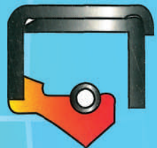
C Outer metal case with reinforcing cap, sealing lip with garter spring