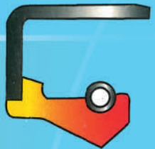
B Outer metal case, sealing lip with garter spring