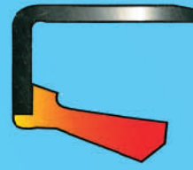
VB Outer metal case, sealing lip