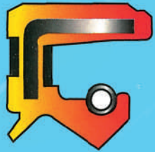
AS Rubber covered O.D., metal insert, sealing lip with garter spring and additional dust lip